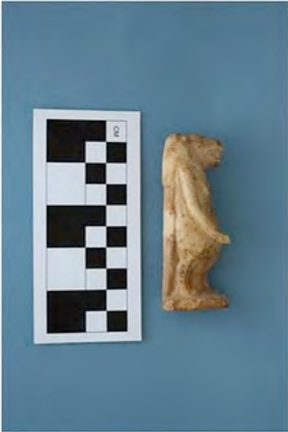
A figure of the hippo goddess Taweret. It was discovered near the harbor of Thmuis.

“In 332 BC Alexander the Great entered Egypt, chasing out the Persians and inaugurating a line of Greek rulers that would last nearly 300 years. Historians refer to this period as the “Ptolemaic Dynasty,” so named after the general that took control of Egypt after Alexander’s death – Ptolemy I Soter. The city of Thmuis flourished during this time. Located on the eastern Nile Delta it grew in population and size.