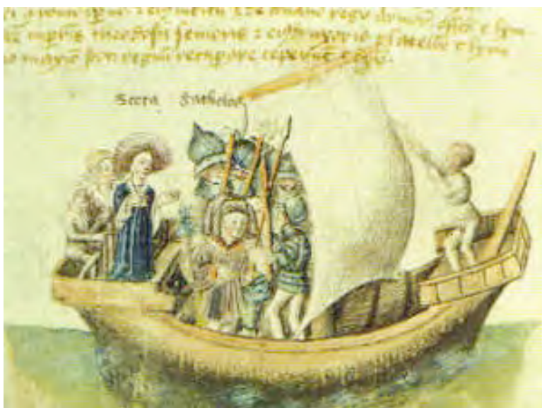
15th century manuscript of Bower's Scotichronicon

“At first glance there doesn't seem to be much connection between the land of the Pyramids and the land of In Bru, but that hasn't put off a number of people, including the ex-owner of Harrods, Mohammed al-Fayed, from believing that Scotland, the place and the people, are in fact descended from an Egyptian princess called Scota.