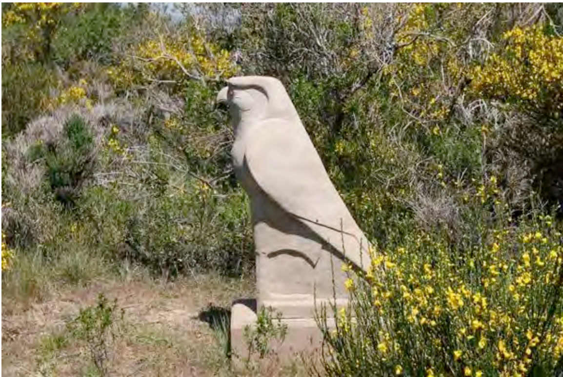
The statue found by the Mount Tamalpais Fire Crew in 2008 off a fire road along Blithedale Ridge.