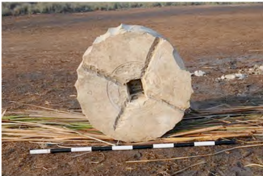
A column from the newly discovered temple of Ptolemy II at Thmuis. It may have been built as a memorial temple for his dead queen - Arsinoe II.

“The size of the columns suggests that it was a large temple. The team plans to use Ground Penetrating Radar and magnetic survey to determine its dimensions and get clues as to its layout.