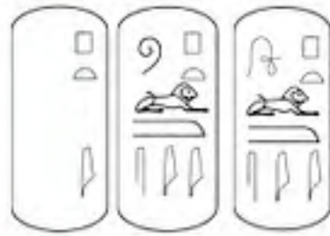
The cartouche of Ptolemy II, found on the temple.