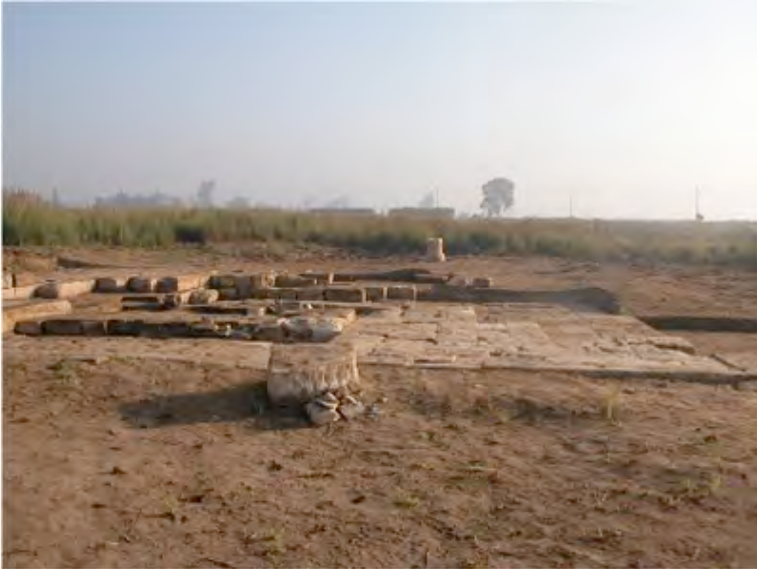
The platform of a first century BC temple at Thmuis.

The second temple story is also a sad one...an ancient Egyptian temple partially submerged in sewage. The brief story ( http://snipurl.com/1r32q8 ) is presented below in full: