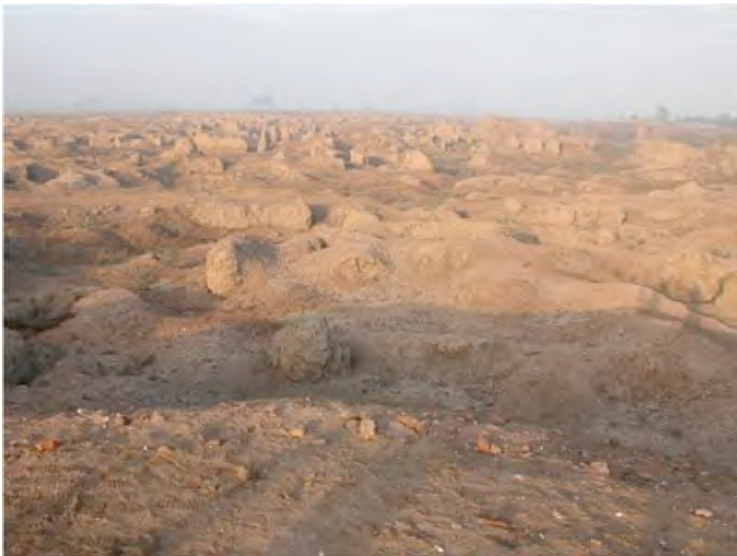
Mud brick structures jut out from the ruins of ancient Thmuis.